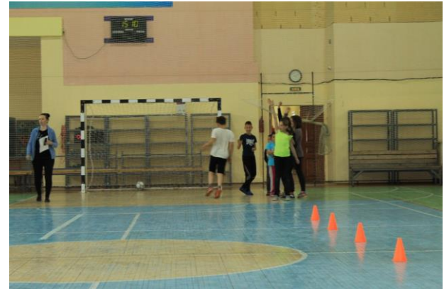
Sport Center since 2012