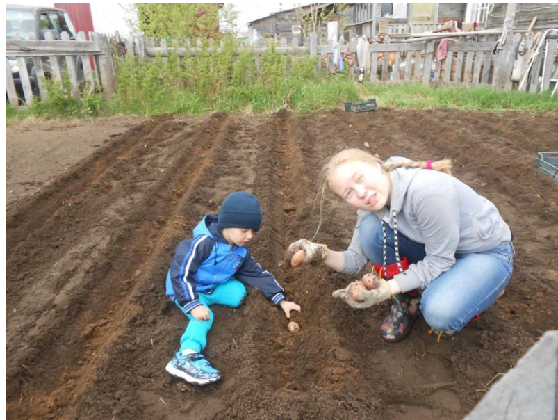
Planting of Potatoes