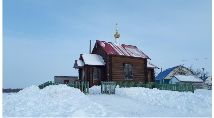
Orthodox Christian Church since 2011