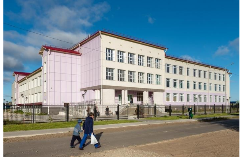
New school opened in 2017