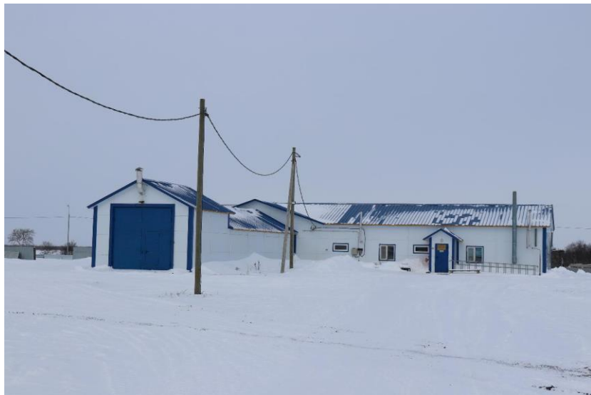
Private Kharp's Cooperative's Farm (cows)