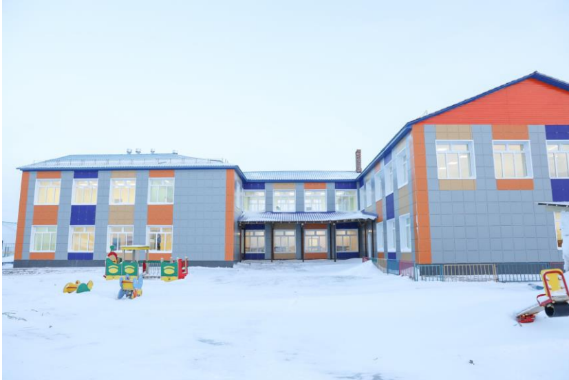
Kindergarten, Renovation 2019