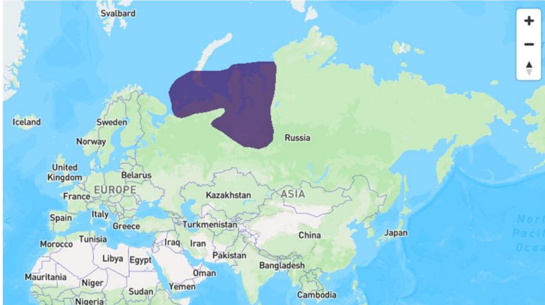
Total territory of where the Nenets live