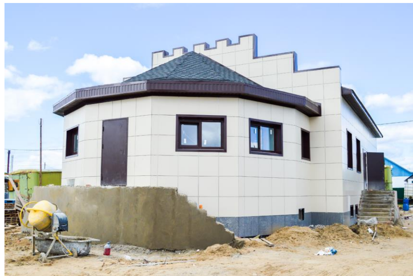
Private Center of Indigenous Nenets Crafts