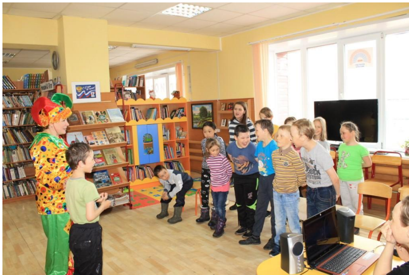
Public Library since 1958, renovation 2020