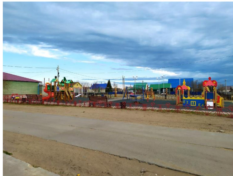
Public Playground For Children