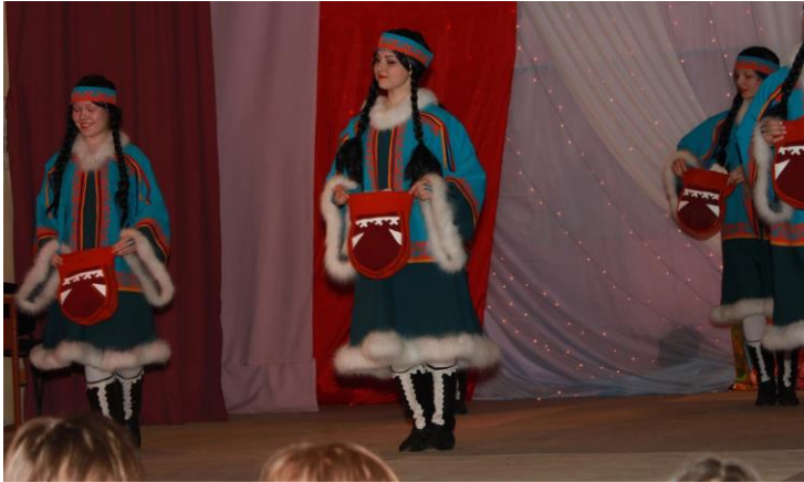
Cultural Center since 1958, Renovation 2021