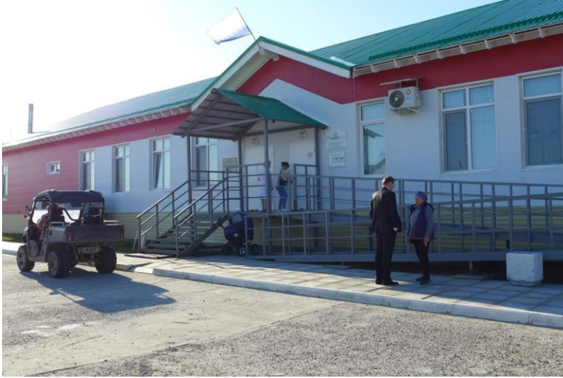
Hospital, Renovation 2014